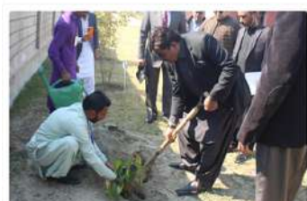
A moment captured during the tree plantation.