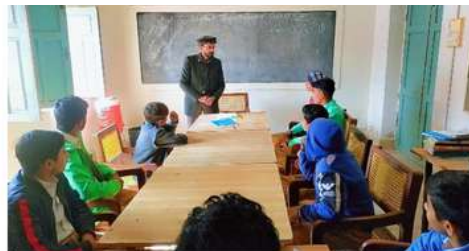
GBHS Main Sindhi