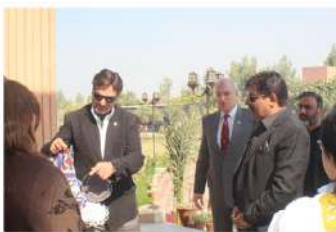
The distinguished guest was welcomed and presented with a cultural souvenir.

Highlighting the pivotal role of teacher capacity building in educational reform, the Minister expressed a commitment to fostering long-term collaboration with SIPD. To mark the occasion, he planted a tree on campus, symbolizing growth and shared vision, and recorded his reflections in the SIPD visitor book. A commemorative souvenir was also presented to the honorable guest.