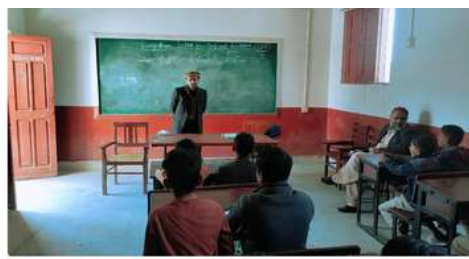
GBPS Main Sindhi