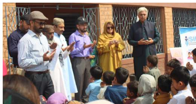
The Dua moment was captured.

The event concluded with the exchange of cultural souvenirs, reflecting appreciation for the ongoing partnership and commitment to school improvement.