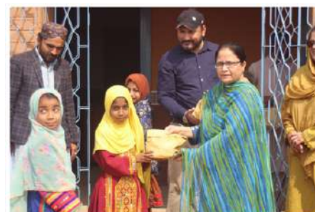
Sweets were distributed among the students.