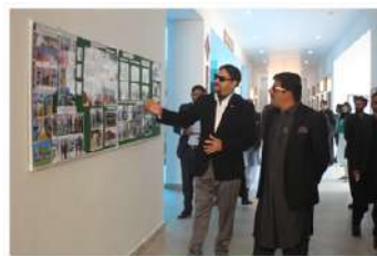
Highlights of SIPD's professional development activities were shared.