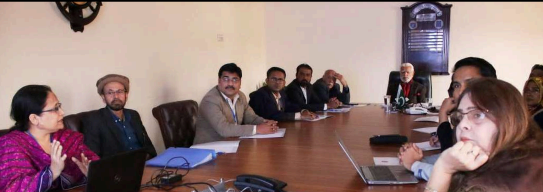
Presenting the CNA framework at Gadap Public School.