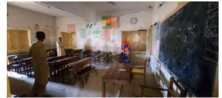
Government Girls Primary School (GGPS) Chambar