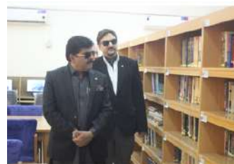
Visited the library