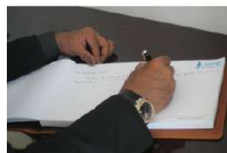
A memorable note penned by the Minister