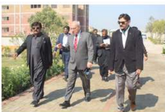
A guided tour of the SIPD premises.