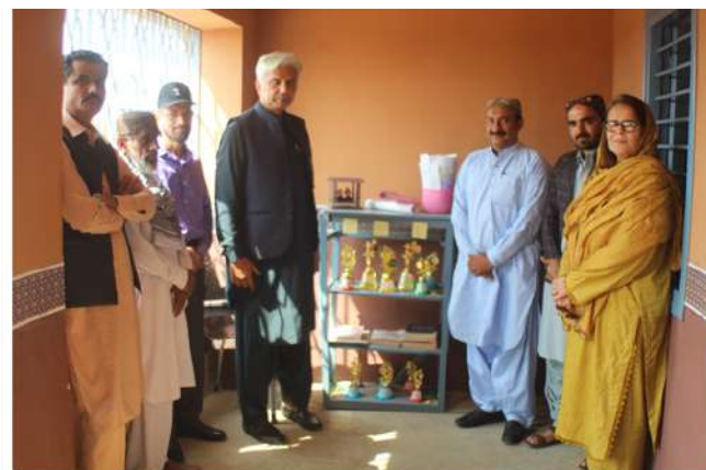
A library corner was set up by the students.