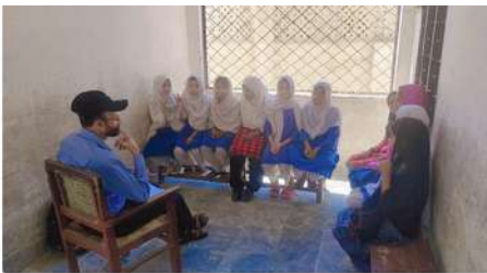
GGPS Piyaro Lund

MSP organized targeted capacity-building sessions for elected Student Representative Council (SRC) members. Training focused on building confidence, enhancing communication, and strengthening decision-making and peer support. Follow-up visits in January & February assessed progress and offered continued mentorship. The initiative reflects MSP’s commitment to fostering student agency and responsible citizenship.