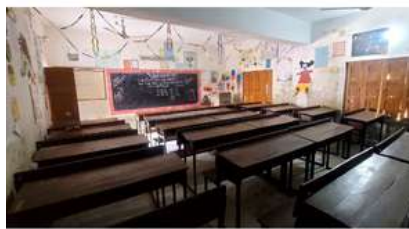
Government Girls Higher Secondary School (GGHSS) Chambar