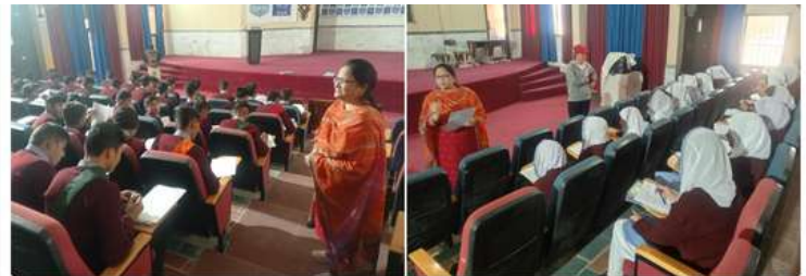
Form completion by students

The Principal of Public School Gadap proposed initiating CNA activities in Teaching & Learning and Leadership & Management, with an aim to prioritize actions ahead of the new academic session. The session concluded with expressions of support from both the Principal and the Chairman for the successful implementation of the CNA process.