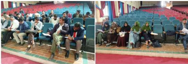
Form completion by teachers