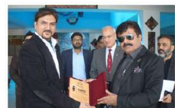
ED SIPD presented the SIPD crest to the honorable guest.