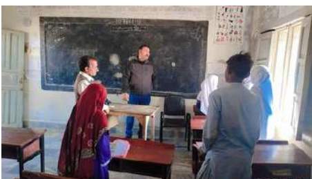
GBPS Manthar Otho