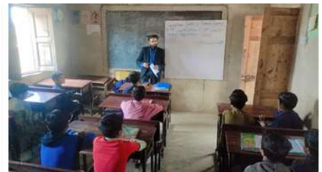
GBPS Shah Baig Lund