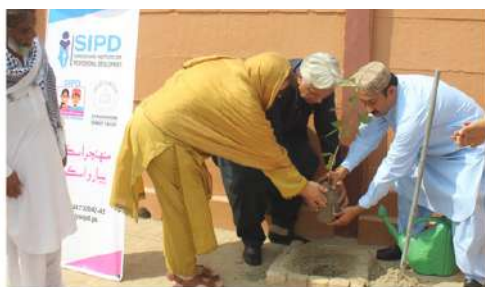
A moment captured during tree plantation.